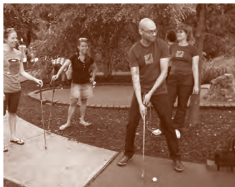
Mini golfers at the event.