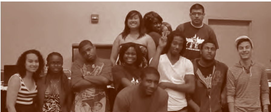
Youth at the National Student Bill of Rights Peoples Movement Assembly at the U.S. Social Forum.