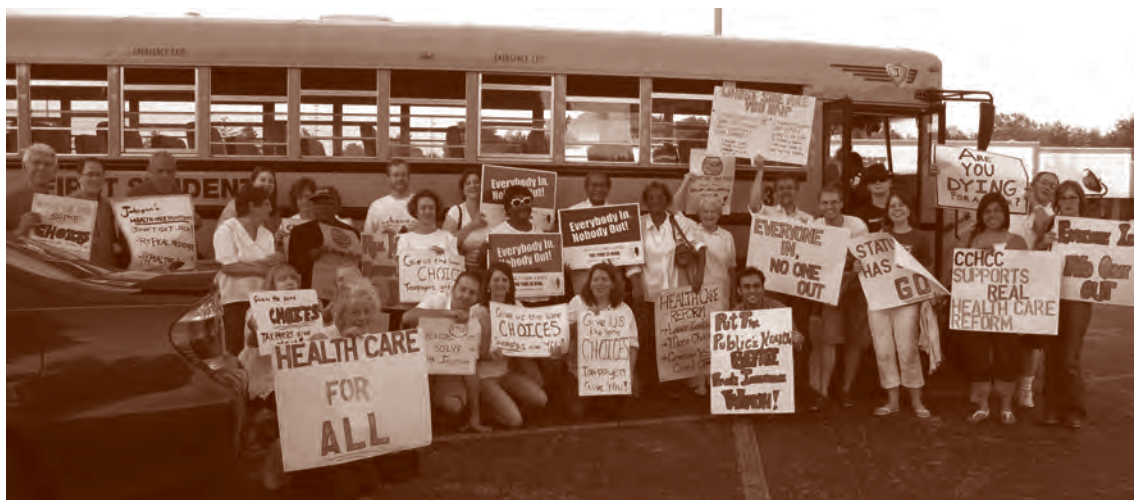
The Campaign for Better Healthcare bus rally.

We are pleased to announce our 2010 grantees! Read all about their work on the following pages. This year, in addition to grantmaking through our regular programs, Crossroads Fund responded to one of the most urgent issues of our times with a special Healthcare Justice Initiative.